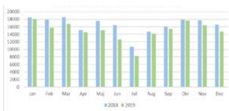
FIGURE 2. A SCHOOL'S ENERGY SAVINGS AFTER THE IMPLEMENTATION OF A GREEN LEASE CONTRACT.

(During five years before signing the contract, no energy action had been made and no active energy saving measures had been implemented.)